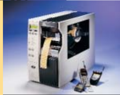
90 XiiiPlus ™

The 90 XiiiPlus printer is ideal for applications that require small, high-resolution bar code labels, such as tracking printed circuit boards and small parts, and identifying small products. The printer's standard 300dpi printhead ensures text, graphics and bar codes always print clearly—essential when label space is limited.